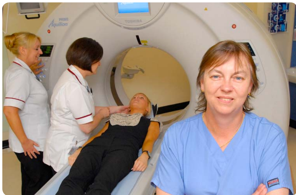
".....TO PROVIDE THE VERY BEST CARE FOR EACH PATIENT ON EVERY OCCASION....."

In October 2010, the Trust Board agreed to invest £2.2 million in three new 'high-tech' modern CT scanners for The Royal Oldham, North Manchester and Fairfield General Hospitals. A new CT scanner was replaced at Rochdale Infirmary in 2008.